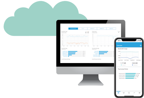
Figure 2. Aruba Central's cloud-based, mobile-friendly management platform